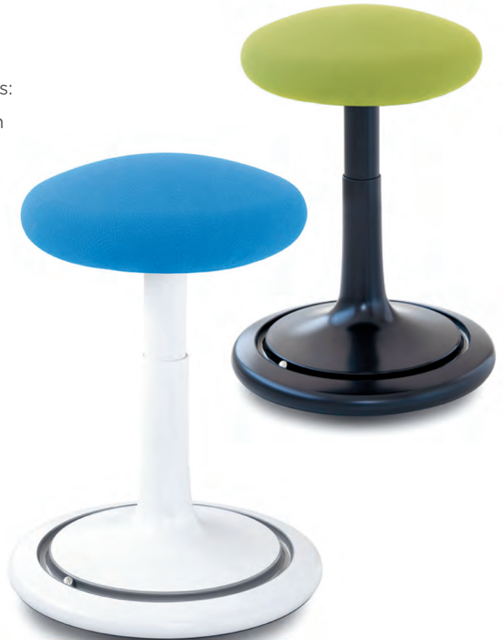
tall 55-77 cm